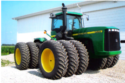
1998 JD 9400 4WD tractor with 2,415 hours

Where can I find it? Subscribe online at Machinerypete.com or call 800-381-0423